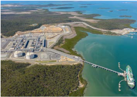
Fig. 1 – Aerial photograph of the GLNG Facility