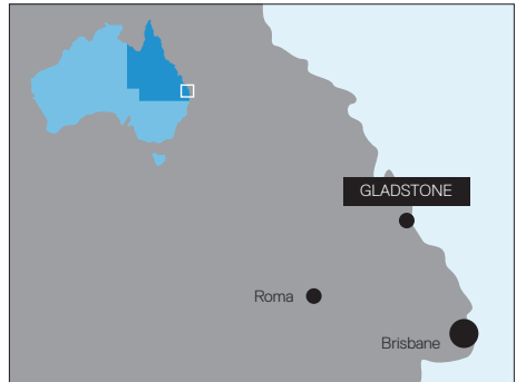
Figure 3 – Locality map

Detailed assessments conducted during the design and construction of the facility shows that possible Major Incidents are not expected to cause any immediate impact beyond the GLNG Facility boundary.